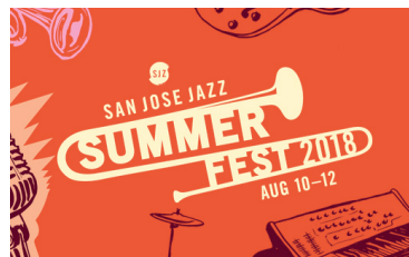
San Jose's 2018 Jazz Summer Festival

Taking place over the weekend following the Summit conference, the San Jose Jazz Festival , one of the west coast's diverse celebrations of Jazz, is a vivid reminder of why we're working so hard to keep this world famous art form alive and well. And then there's San Jose's great food scene!